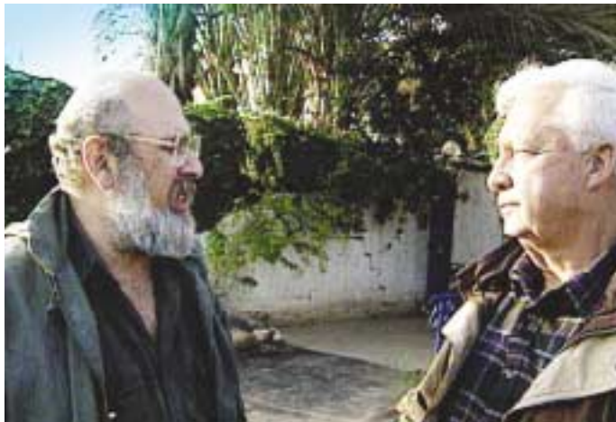
Zola with Prime Minister Ariel Sharon discussing current tensions in Israel

The distaste for Israel evident in coverage of the current crisis is a mystery to me. I’m not talking about the Arabs, who have their own obvious reasons for hating Israel, not the least being that Israel is a living reproach to Islamic civilization’s inability to adapt to the modern world. The weakness of Islam vis-à-vis a West it once terrified and dominated is exposed daily by the strength and confidence and prosperity of a tiny nation dwarfed by the population and resources and armies of its adversaries.