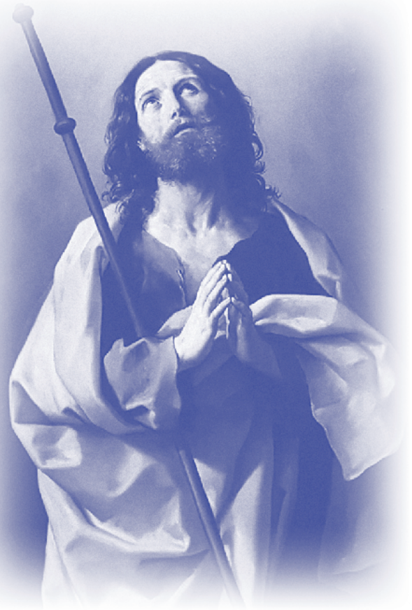
Saint James the Greater, Guido Reni (1575–1642), Museum of Fine Arts, Houston