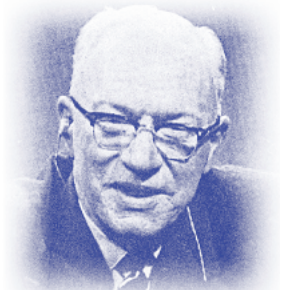
William Barclay (1907–1978)