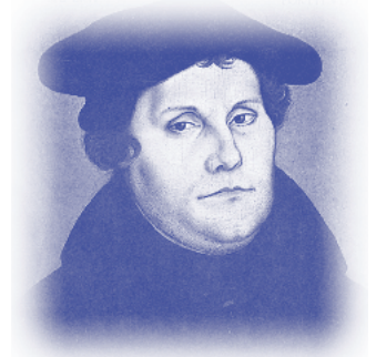
Martin Luther (detail) Lucas Cranach the Elder (1472–1553)