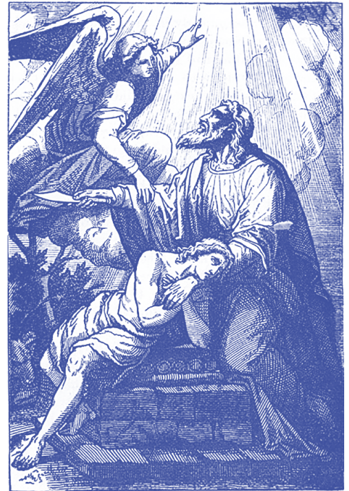
Abraham Offering Up Isaac (1873) engraving by Charles Foster

As I noted in last month’s lesson, God is sovereign and will do as He wants with whomever He chooses.