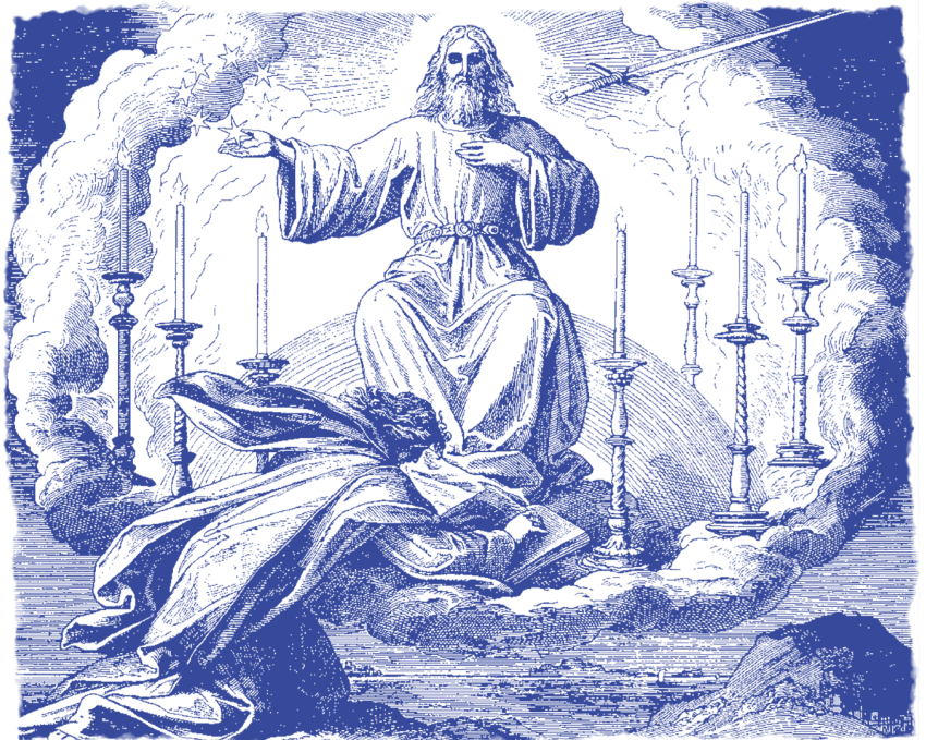
Jesus Christ Reveals Himself to John, woodcut for Die Bibel in Bildern, 1860, by Julius Schnorr von Carolsfeld (1794–1872)

Now I saw heaven opened, and behold a white horse; and He who sat upon him was called Faithful and True, and in righteousness He judges and makes war.