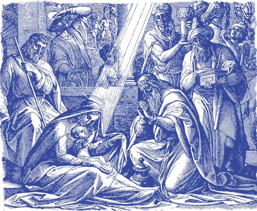
Adoration of the Christ Child , woodcut for Die Bibel in Bildern , 1860, by Julius Schnorr von Carolsfeld (1794–1872)

through His Son on that first Christmas — no matter what time of year it actually occurred . The point is: It actually occurred! When storekeepers in Jerusalem closed shop and retired for the evening, they did not know what was happening in Bethlehem. In fact, neither did that little town of Bethlehem. The Messiah that the Jews were expecting to deliver them from Roman rule was soon to be delivered Himself — as an infant wrapped in the garments of flesh and swaddling linen. This was definitely not the expected warrior wrapped in battle armor!