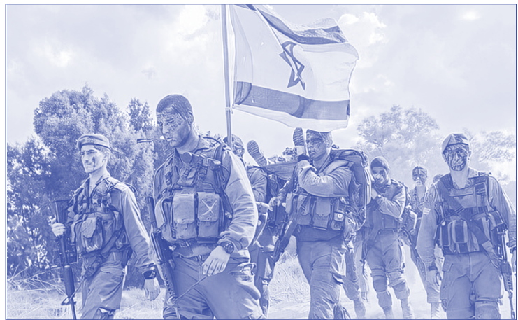
IDF soldiers finish their beret march following eight months of training

Military service is not just about great opportunities. It can be dangerous. Though the October 7 atrocities were horrible enough, the massacre also started a war. Here in Israel, we wake up daily to photos of newly fallen soldiers. Seeing pictures of young men who gave their lives for our protection has become a heartbreaking routine . Some days are more difficult — like January 22, when 21 IDF soldiers died in Gaza and many others were seriously injured in an explosion. December 15 was another challenging day, when three Israeli hostages who escaped their Hamas captors were mistakenly shot and killed