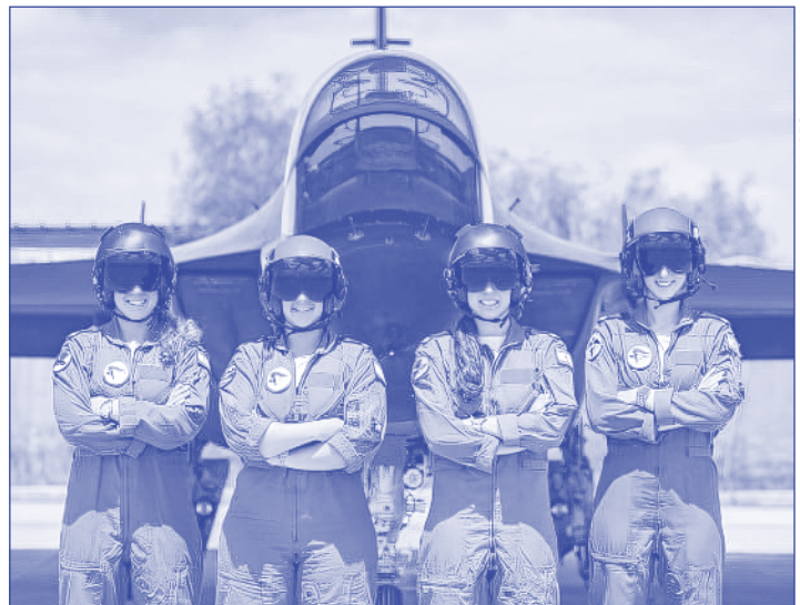
Four female pilots from the June 2021 graduating class of the IAF Flight Academy

Yet within weeks, he got a call from the air force pilot program. This extended testing occurs over several months. If recruits continue to succeed, they aren’t screened for any other roles. The IDF believes that finding the best pilot candidates takes priority over all other military positions.