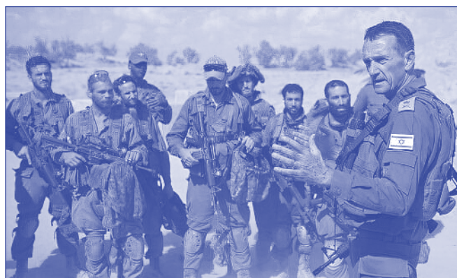
IDF Chief of Staff Lt. Gen. Herzi Halevi (right) addresses troops in southern Israel on October 15, 2023

Because most airlines suspended flights to Israel by the evening of October 8, many young adults struggled to get to Israel. On airline flights that were still operating, many families and business travelers who had tickets voluntarily gave up their seats so that reserve soldiers could return. El Al, Israel’s national airline, flew special aircraft to several key cities such as Hong Kong and New York and then returned to Israel with reservists. The mood on those flights was somber, as men and women understood that they were returning to fight and possibly sacrifice their lives on behalf of the country.