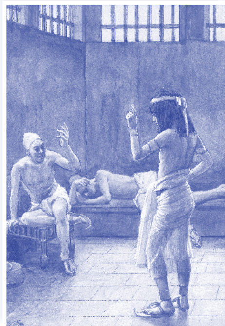
Joseph Interpreteth the Dreams While in Prison, painting by James Jacques Joseph Tissot (1836–1902)

Joseph asked the two former servants of the king why they were downcast. That seems like a strange question to ask prisoners. Yet this seemingly odd question reveals an amazing truth — Joseph