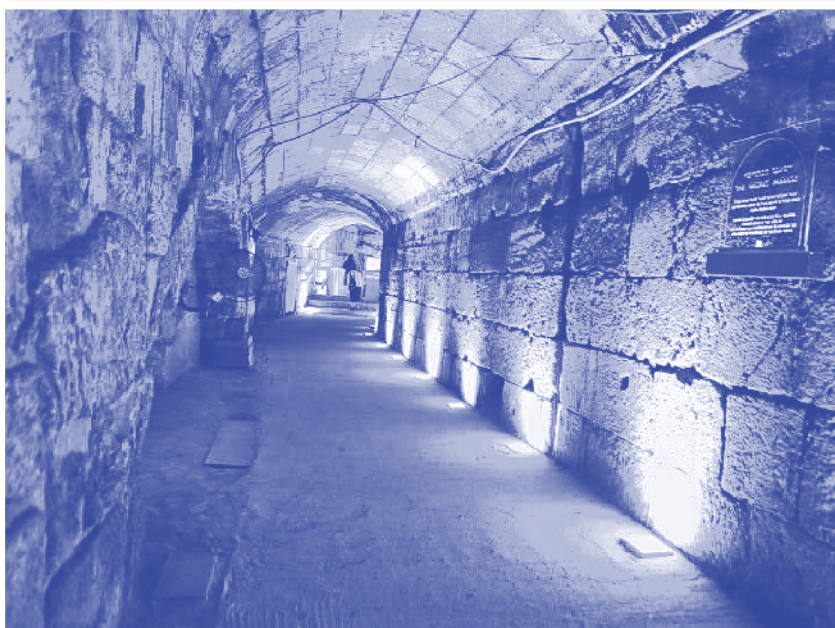
The tunnels beneath the Western Wall