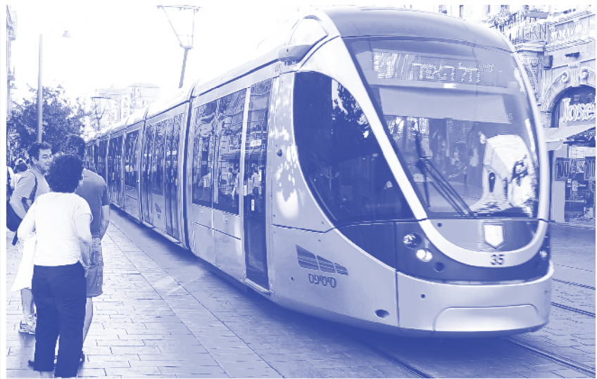
The Jerusalem Light Rail

Greetings from the Holy Land. Modern Jerusalem is a very special place to visit — some say that it's the most extraordinary place on Earth. Along with contemporary elements, the city offers layer upon layer of archaeological sites, fascinating museums, delicious food, and more. Remarkably, it maintains all this while being one of the most contested cities in the world.