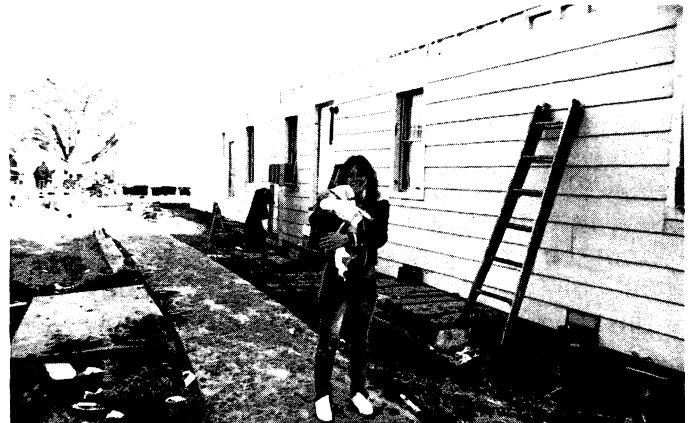
New construction is underway steadily at the Ruff House since our program ran.

For now, I thought we would share the enclosed photos with you and thank you again for your generosity and your willingness to help out.