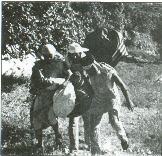
Joseph's brothers cast him into a pit.