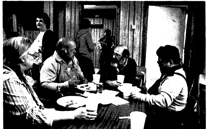
In the former Ruff House dining room there would barely have been room for four people to eat together.