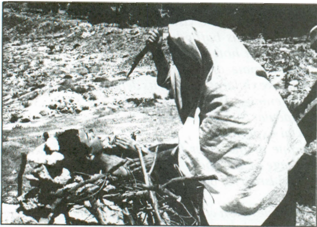
Abraham prepares to obey the will of God.

The photos below are stills from our new fall series, “Messiah”. Israeli actors portray the biblical characters on location throughout the eleven programs.