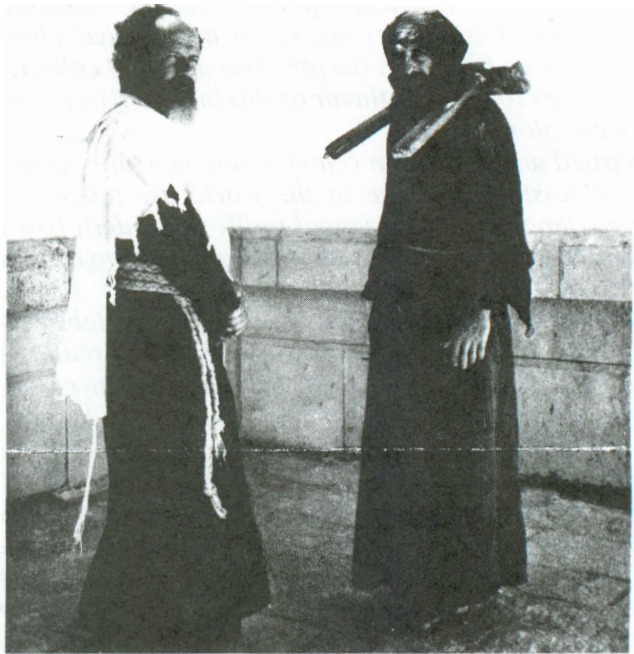
Israeli actors portray the biblical prophets in our new “Messiah” series. Here Hananiah approaches Jeremiah, who wears a yoke on his shoulders to symbolize the yoke of judgment upon Israel.