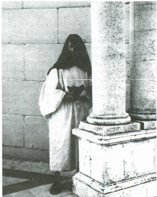
Judas, in his guilt, hides in the corner of the Temple courtyard with his bag of blood money. In a moment he will hurl the 30 pieces of silver at the feet of the priests.