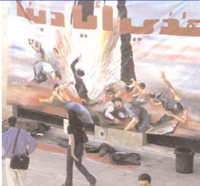
Palestinian students walk in front of a poster glorifying the suicide bombing and deaths of Jews at a Pizza restaurant in Jerusalem.