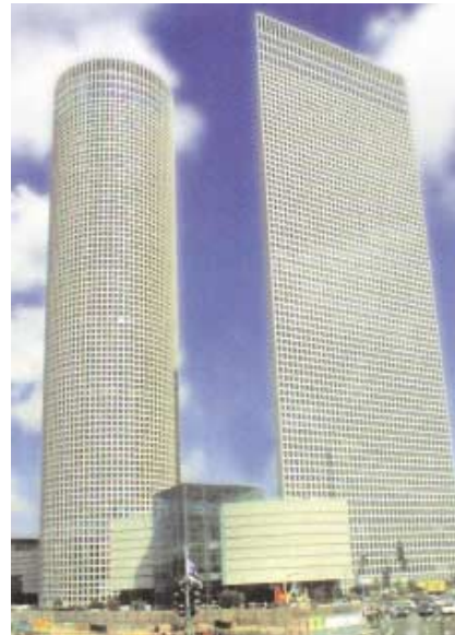
Prime Target?: Israeli experts claim that had suspicious planes closed in on buildings like Tel Aviv’s Azrieli Center, warplanes would have been deployed.