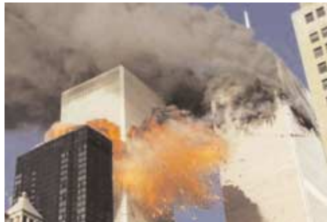
New York City’s World Trade Center under attack by radical Islamic suicide squads on September 11.

Those two concepts are unforgivable to them as well as the leaderships of Iran, Iraq, Syria, Libya, the Palestinian Authority, Saudi Arabia and the other states that train, finance, and send terrorists against the democracies of Israel, the U.S., etc.