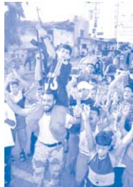
A celebration in the streets after hearing news of the successful attacks on the World Trade Center.