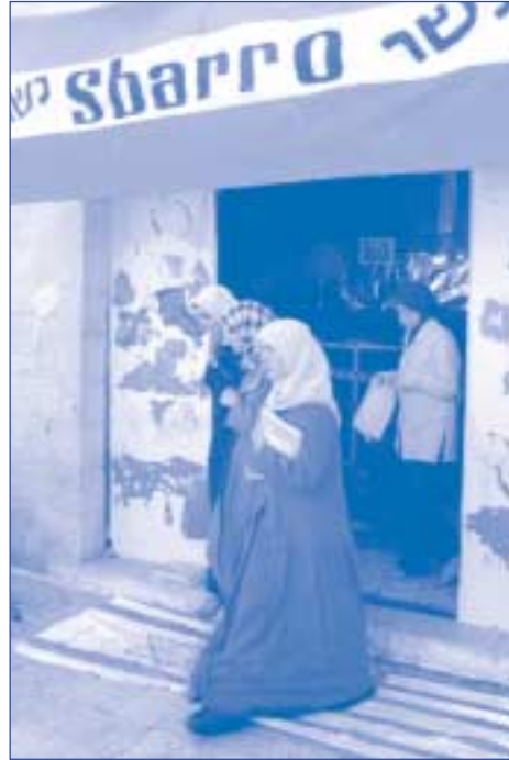
Palestinian female students walk on American and Israeli flags as they leave an exhibition at An Najah University lauding the Palestinian suicide bombing of the Jerusalem pizza restaurant Sbarro this summer.

Palestinians, including PA police, paraded through the streets of Gaza and the West Bank. Reuters in Beirut reported that "jubilant Palestinians took to the streets of refugee camps of Lebanon and the West Bank, waving Palestinian flags and distributing sweets." AP film footage of these celebrations, which included members of Arafat's security forces, was confiscated. Palestinians threatened the life of one videographer should the news agencies air footage of these mass celebrations, numbering more than 3,000 in Nablus.