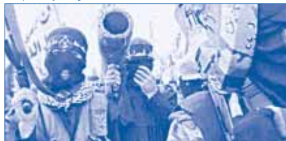
Al-Aqsa Martyrs Brigade terrorists

So when CanWest's National Post recently published a Reuters report, they exercised their right to change this Reuters line that whitewashes Palestinian terror: