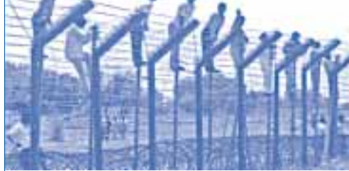
THE FENCE between India and Pakistan

After all, the India-Pakistan conflict is just as enduring and fierce. It threatens world peace no less than the Palestinian-Israeli conflict. The Indian fence is at least twice as long as the Israeli. It too creates facts on the ground unilaterally; it too entails land disputes and separation of innocent farmers from their land.