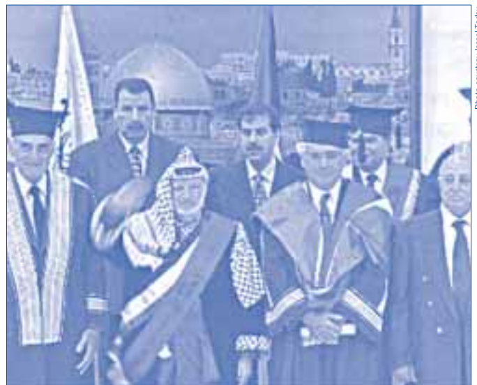
DR. ARAFAT: Yasser Arafat, who denies the existence of the Biblical Temples, receives an honorary doctorate from Al Quds University in Ramallah.